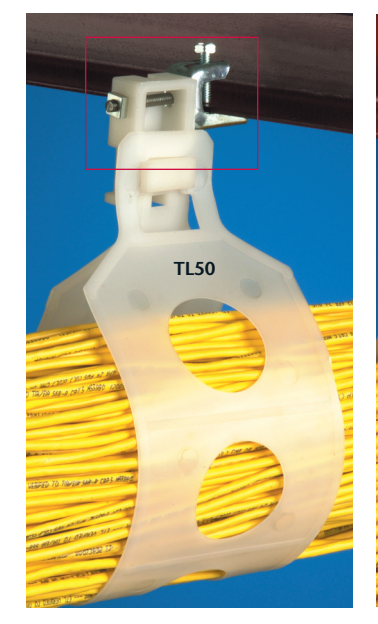
SINGLE LOOP Perpendicular mounting on 1/4" beam clamp