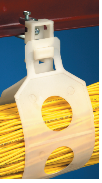
SINGLE LOOP Parallel mounting on 1/4" beam clamp