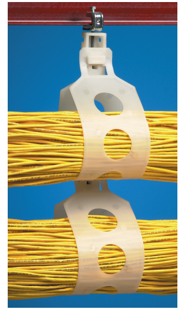
MULTIPLE LOOP HANGERS Stacked, parallel mounting on 1/4" rod