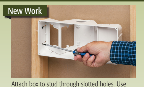
minimum of (2) #6 x 1-5/8" wood screws. Pull wires.