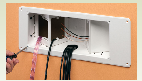
Assemble trim plate. (Retrofit must also use a minimum of (2) \#6 \times 1-5/8" wood screws in adjacent stud.)