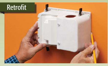
Cut a hole using enclosure next to stud. Use box without trim plate, as a template. Pull wires and insert box in hole.