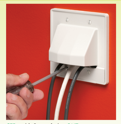
CER2 with Scoop facing OUT. Lower plate secured.

Each of our SCOOPs mounts directly to the wall with drywall screws. For added support, mount to one of Arlington's low voltage mounting brackets; LV1 to LV4.