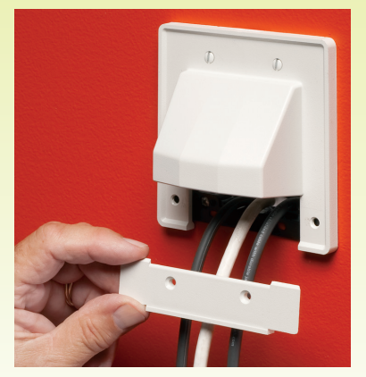
CER2 with Scoop facing OUT. Lower plate removed.